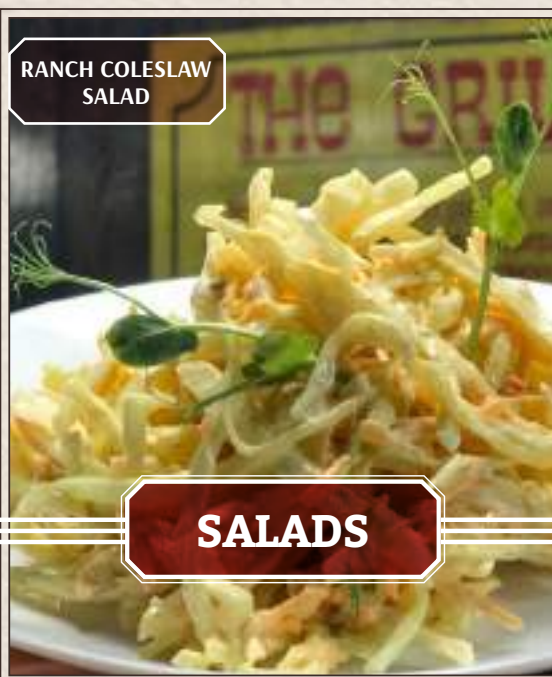
RANCH COLESLAW SALAD

RANCH COLESLAW 200g 45 author's version of the classic