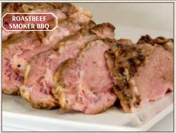
ROASTBEEF SMOKER BBQ